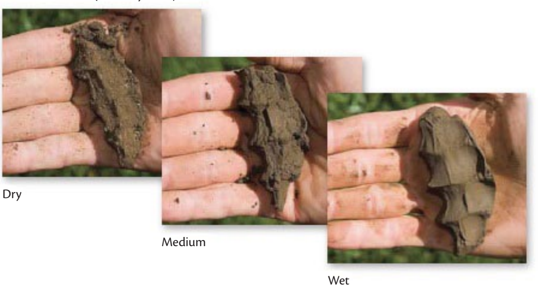
Figure 3. Determining soil texture and moisture by the feel method.