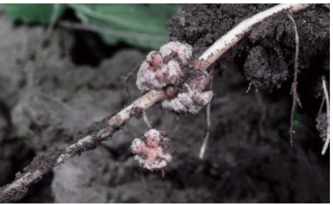
Figure 2. Nitrogen-fixing nodules on roots of berseem clover ( Trifolium alexandrinum ), an annual legume. These nodules are formed by beneficial bacteria that enter the root hairs and cause rapid division of root cells.

Pastures with a high clover content will often exceed the nutritional requirements for most classes of horses and can quickly cause a variety