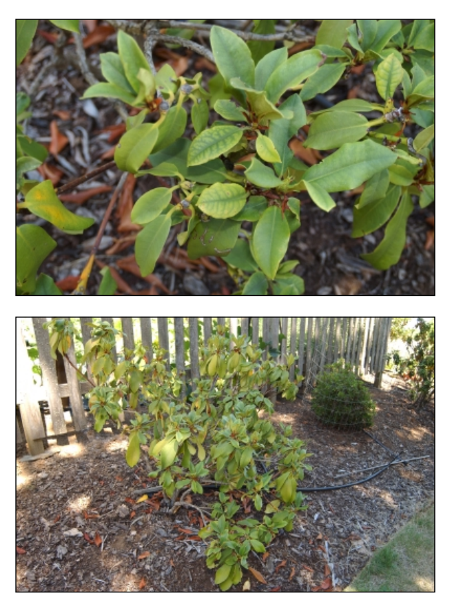
Figure 2.—Yellowed leaves do not always indicate that the soil pH is too high. This rhododendron is growing in soil with a pH of 5.4. Always check the soil pH before deciding to acidify your soil.

Aluminum sulfate also lowers soil pH, but we do not recommend its use because of potential harmful side effects (aluminum toxicity to plant roots), which can significantly reduce plant growth.