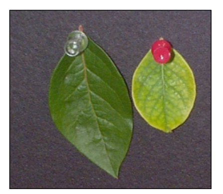
Figure 1.—Normal blueberry leaf (left) and iron-deficient leaf (right). Note the pale green leaf area and contrasting green veins on the irondeficient leaf.

deficiency, the new growth of sulfur-deficient plants is affected first. Nitrogen deficiency is seen first in older leaves. If an application of nitrogen or sulfur does not affect plant color, consider iron deficiency, and hence high soil pH, as a possible cause of yellow leaves.