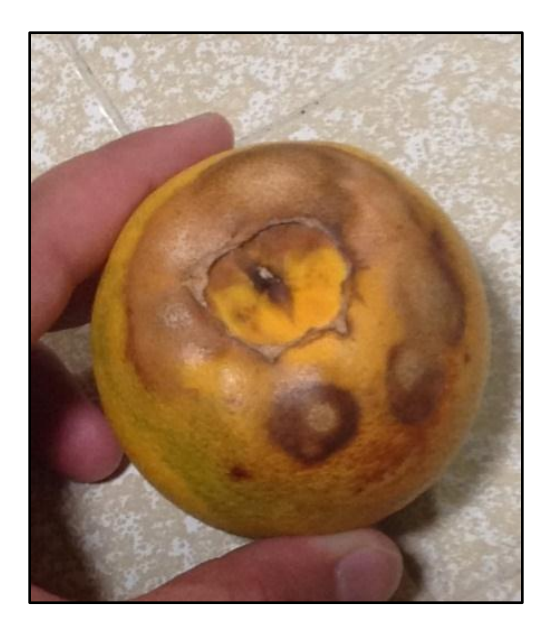
This is a physiological disorder of low calcium in the fruit. Calcium is required for normal cell growth and in relatively high concentration for

Blossom-end rot begins as small tan, water soaked lesions on the blossom end of the fruit. The lesion enlarges and becomes sunken, dark, and leathery. On peppers, the lesion is more commonly found on the side of the fruit towards the blossom end. Also, on peppers it can be sometimes confused with sun scald. Fruit infected by blossom-end rot ripen often become infected with secondary organisms such as Alternaria spp (most likely the surrounding tissue in the photo below.