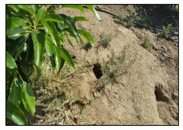
Figure 4: California ground squirrel burrow openings in an avocado orchard.