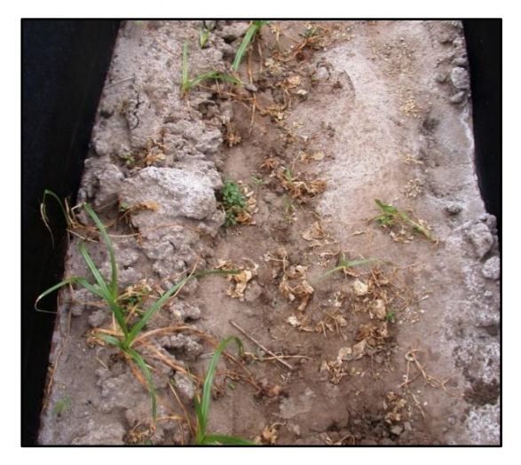
Figure. Weed control in strawberry furrows prior to planting with 9% by volume of fatty acid herbicide (left) and weeds in untreated check (right)