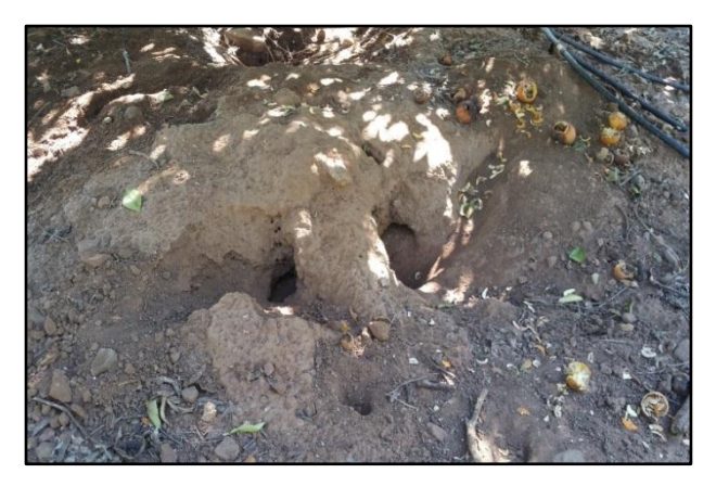
Figure 3: California ground squirrel burrow openings in a citrus orchard.