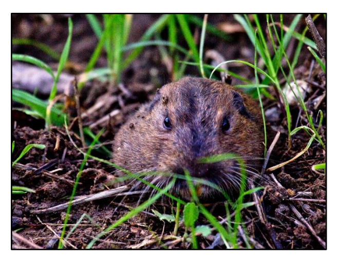
Figure 2: Photograph of pocket gopher.