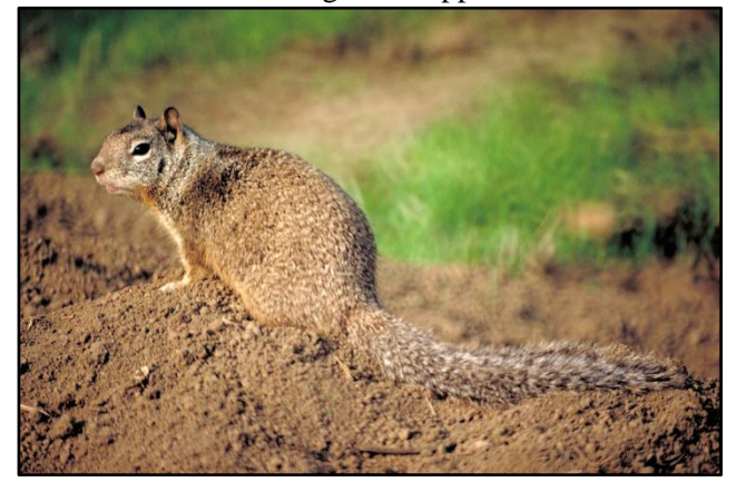
Figure 1: Photograph of California ground squirrel.

records of pest population levels, control measures implemented, and the effect of management methods, can be used to help determine the best management approach.