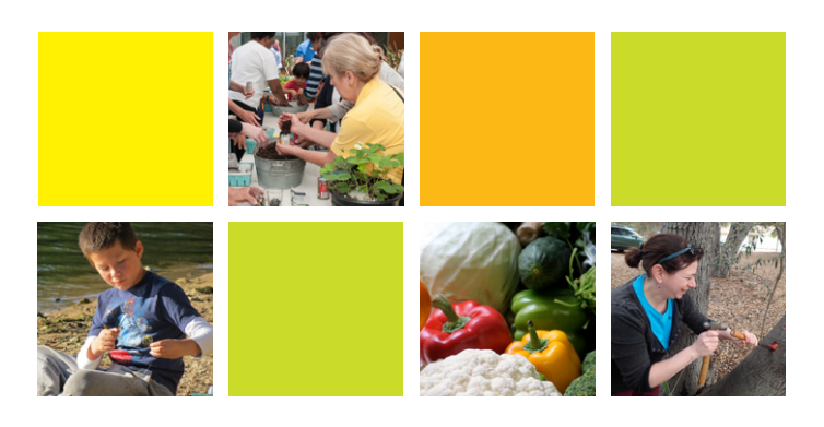
University of California Cooperative Extension Los Angeles County