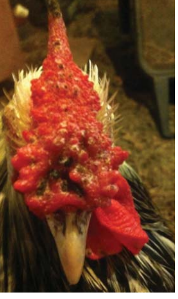
Figure 2. Pox lesions on chicken comb.