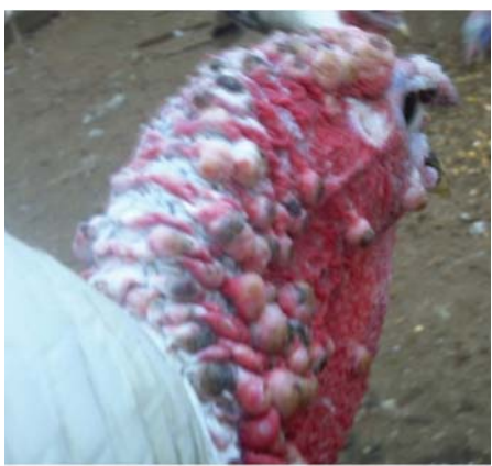
Figure 3. Pox lesions on the head of a turkey.