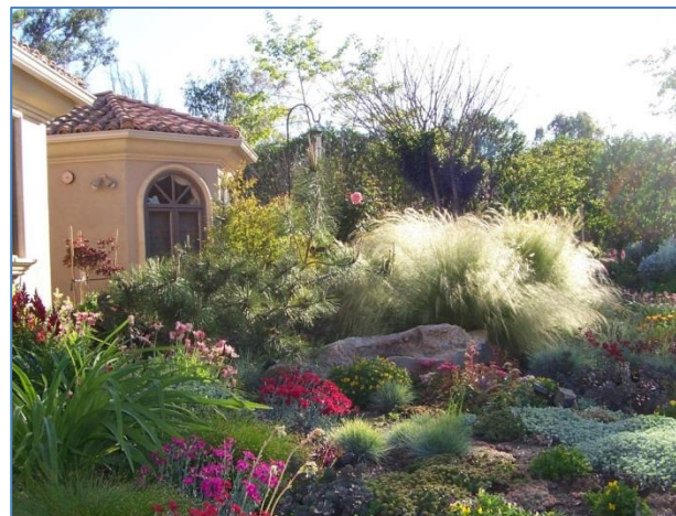
Figure 8 – Drought tolerant grasses and plants surround a home in Rancho Santa Fe, Calif.