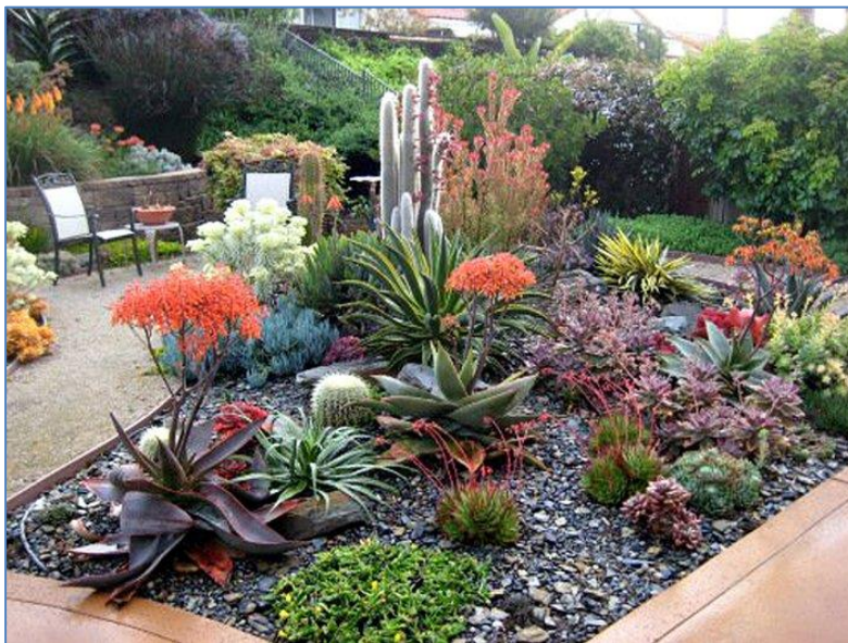
Figure 5 - A 3-inch layer of wood chip mulch conserves water, reduces weeds and water runoff.

Avoid overfertilizing. Applying too much nitrogen leads to an overabundance of foliar (leaf) production and the need for more water. Most mature landscape plants will get through a season or two with no supplemental fertilizations. Fruit trees and vegetables require adequate nutrients for crop production. When water is scarce fruit trees should not be fertilized; while the crop may be sacrificed, this practice reduces water requirement and will help keep the tree alive. Annual vegetables may get by on slow release nutrients supplied by organic matter and compost.