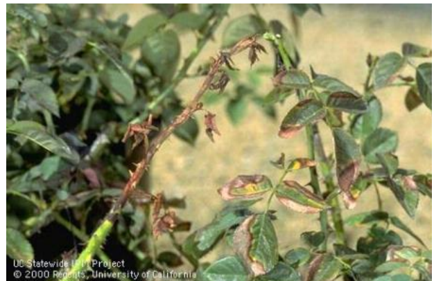
Figure 1 - Drought damage on a rose plant.

Plants that do not receive enough water will eventually show signs of water stress. During a drought or under governmental restrictions aimed at water conservation keeping plants alive can be particularly difficult. Although plants vary in the amount of water they require for optimal growth and development, most exhibit characteristic symptoms when they are in need of water. Because plants need to be