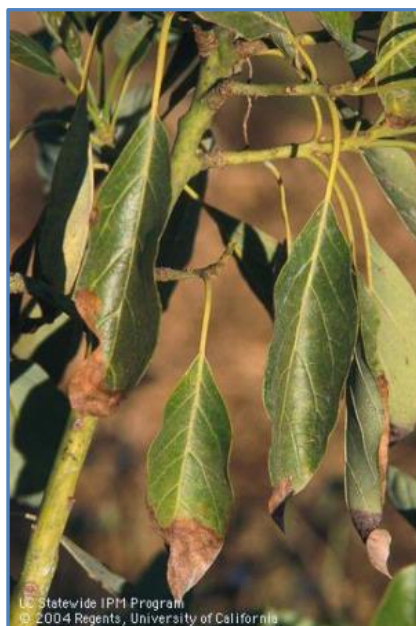
Figure 2 - Salt damage mimicking drought damage on avocado.

watered at an early stage of water deficit to prevent irreversible damage, it is crucial to check plants regularly for symptoms of drought, preferably during the afternoon when symptoms are most evident. Also ensure that damage identified as drought stress is not due to other conditions that can mimic drought such as frost, salts, insects, and diseases.