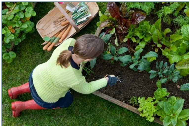
Figure 6 - Plant only family favorites and avoid an oversized garden that is larger than your needs.

the garden) allows gardeners using automated drip irrigation systems to target water applications based on water needs of individual zones, reducing water waste.