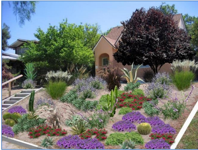
Figure 7 – Beautiful, drought-efficient landscapes save water and time and reduce erosion and runoff.

As previously stated, the heat of the summer is not the time to remove and replace your current landscape plants with drought efficient species. Plants that are not established – even drought tolerant natives - require more frequent watering than the same species growing for a season or two that have developed a deeper, more extensive root system. Fall is the best time to establish native plants and fall or spring are both good times to swap thirsty plants with more drought-efficient non-natives.