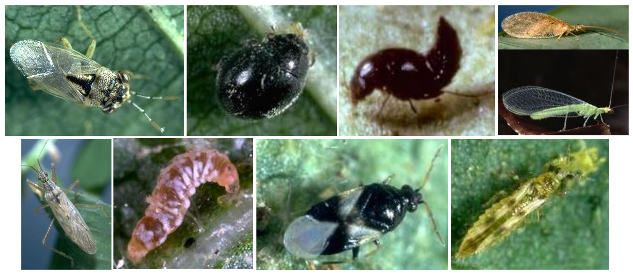
Top row: Big-eyed bug, black lady beetle, black rove beetle, brown (upper), and green lacewing (lower) Bottom row: Damsel bug, predatory midge larva, minute pirate bug, and sixspotted thrips.

In addition to the predatory mites, several species of natural enemies feed on spider mites. They include big-eyed bug ( Geocoris spp.), black lady beetle ( Stethorus sp.), black rove beetle ( Oligota oviformis ), brown lacewing ( Hemerobius spp.), damsel bug ( Nabis spp.), green lacewing ( Chrysopaspp. ), minute pirate bug ( Orius tristicolor ), predatory midge ( Feltiella acarivora ), and the predatory sixspotted thrips ( Scolothrips sexmaculatus ).