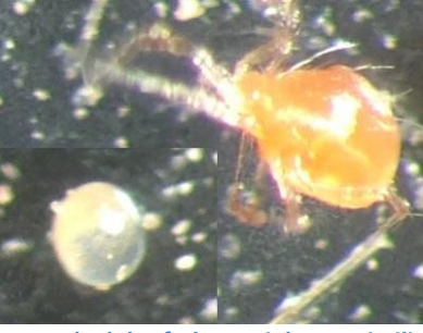
Egg and adult of Phytoseiulus persimilis