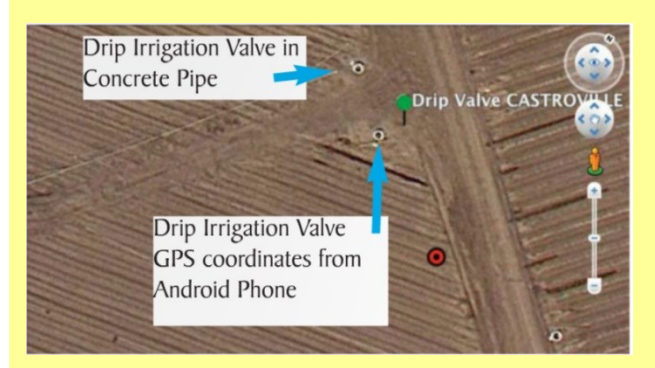
Figure 1. Ariel view of drip valve (green pin) and GPS waypoints.

Say you are standing at a permanent marker and you record this point on your smart phone's <u>Global Positioning System</u> (GPS) application. Now what? How accurate is your smart phone in locating this point? In this example we will confirm the location of an irrigation valve (Fig. 1) which was used as a permanent marker for a California artichoke trial. Note: The smartphone application also known as an "app" can be found under maps or navigation.