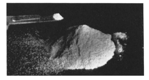
Top. Colony of Bacillus thuringionsis growing on nutrient agar. Center. Microscopic picture of the spores from a three-day culture. Bottom. Powder made from spores can be stored for a year without losing its virulence.

below an economic level—about 20 larvae per two sweeps of net—while in each of the untreated check plots the population remained at a destructive level—from 61 to 90 larvae per two sweeps. In the two remaining test plots the count was brought down to just slightly above 20, and would very probably have been reduced further in another day or two. The plots were cut for hay before the tests could be run to their desired completion.