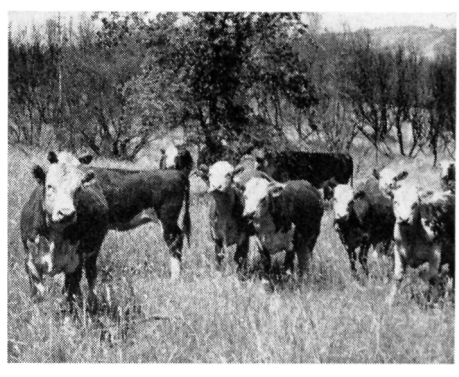
The most important single factor in range improvement is the management of grazing practices to discourage weedy species and encourage desirable annuals and perennials.

Among the annual legumes, bur clover is common to most areas except the granitic soils in the Sierra foothills on the eastside of the San Joaquin Valley and the reddish soils in the Sierra foothills of the Sacramento Valley. Subclover does well in acid soils if other conditions are favorable. Roseclover thrives on soils that do not support good growth of bur clover or subclover. Crimson clover has done well in the intermediate elevations of the Sierra. Spanish clover is widely distributed in the state, and the sweet clovers will grow at elevations up to 5,000 feet.