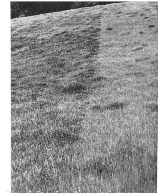
Stand of subclover and annual grasses fertilized with gypsum, left, as compared with check plot to right at Hopland Field Station.

S TUDIES ON the sulfur requirements of subclover, Trifolium subterranean L., were initiated because of the importance of this species in the coastal counties of California where sulfur deficiencies in the soils are widespread. It has been discovered, for example, that many yield