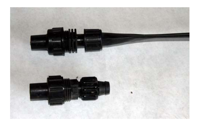
Figure 4. Flush valves release water trapped in the end of drip lines after the irrigation ends.

Figure 3. Use of preset pressure regulators on the submain to regulate pressure in groups of drip lines located at similar elevations.