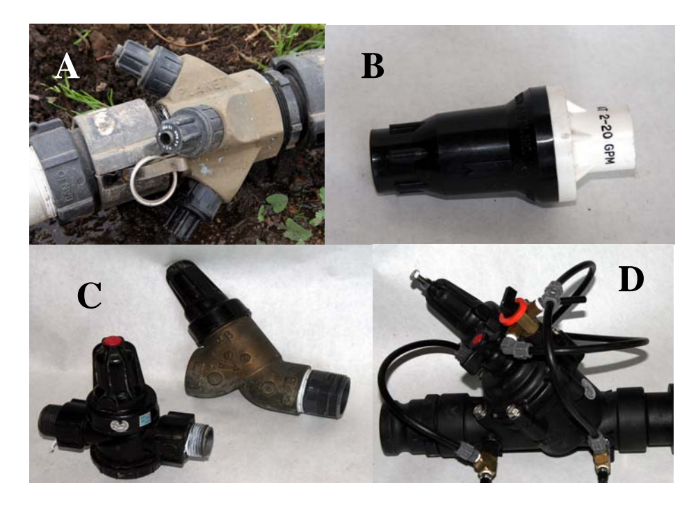
Figure 2. A brass pressure regulator preset for 12 psi can be used on 2 inch diameter pipe for flow rates up to 75 gpm (A), a plastic pressure regulator preset to 15 psi can be used on 1 inch diameter pipe and for flow rates from 2 to 20 gpm (B), adjustable plastic and brass pressure regulators for 1 inch and 1.5 inch diameter pipes, respectively (C), and a plastic pressure regulating valve with pilot for 2 inch diameter pipe (D).