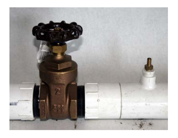
Figure 1. A gate valve with a Schrader valve allows pressure to be adjusted and monitored in an irrigation block, but the valve must be adjusted manually to compensate for changes in upstream pressure.

Designing drip systems for operation on hilly ground can be challenging and the options for attaining good uniformity is highly dependent on the terrain. Fortunately, new types of components are available, such as pressure compensating tape, inexpensive pressure regulators, and flush valves, that can be used to improve uniformity. With the help of an irrigation designer, one should be able to find an economical solution to attain good irrigation uniformity on hilly land using drip.