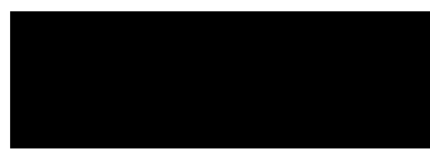
Table 5. Effect of PAM treatments on chemistry and nutrient content of sprinkler run-off relative to fixed control treatment (average of 3 sites).

Table 4. Effect of PAM treatments on chemistry and nutrient content of sprinkler run-off (average of 4 sites).