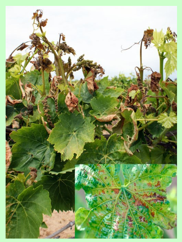
Figure 1. Thompson Seedless leaf (inset) displaying individual cell damage. Frost damage to Thompson Seedless shoots and flower clusters.

In order to minimize damage caused by frost, vineyard soils should be prepared for maximum heat absorption during the day and release at night. Optimal conditions include soils that are free of vegetation, firm in texture, and moist. Moist dark soils improve their ability to absorb heat during the day and radiate it at night as ambient temperatures drop. Soil texture will also have an impact on heat absorption. Vineyards planted to sandy soils are more prone to frost damage because they retain less water. Additional water may be needed if winter precipitation has not been adequate to maintain soil moisture. Prior to a predicted frost, the goal should be a uniformly distributed irrigation that allows for maximum heat absorption. Table 2 shows the benefits of a bare, firm moist soil in contrast to less optimal vineyard floor conditions. Soils that have been recently cultivated or disked do not retain heat well because they are dry and have numerous air pockets and thus should be irrigated soon after cultivation. Native vegetation or cover crops that insulate soils from absorbing heat should be mowed, disked, and irrigated, unless significant precipitation makes irrigation unnecessary. Irrigation during a frost event can be beneficial. On nights that low temperatures