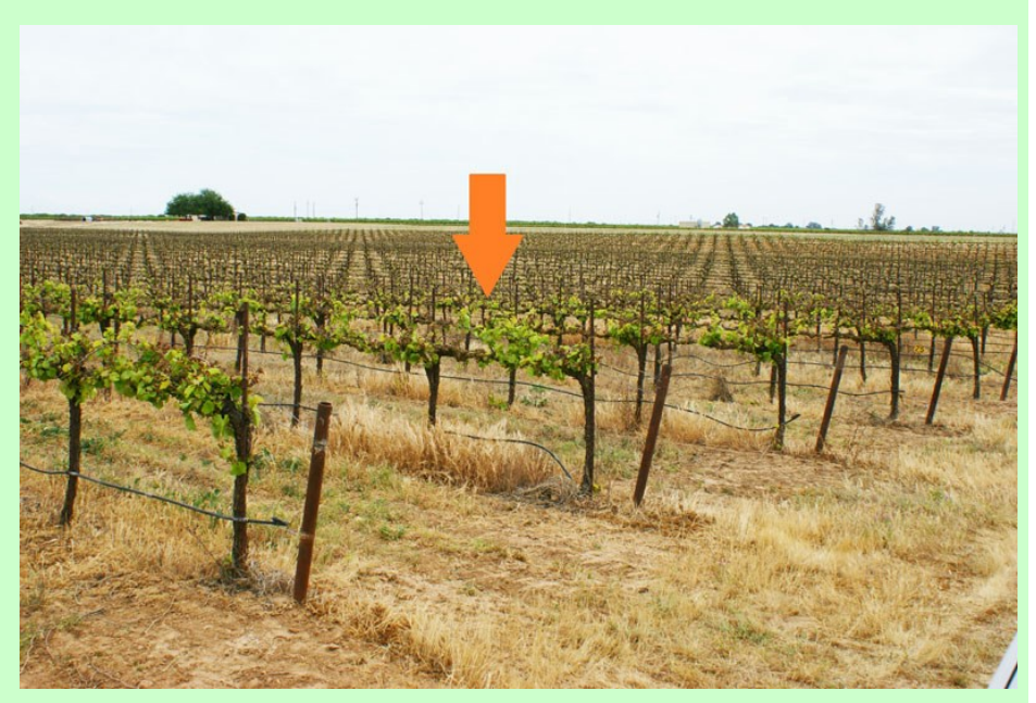
Figure 2. Orange arrows showing the downward slope of a Rubired vineyard where severe frost damage occurred.

turned on to wet as much soil as possible. Growers will have to be especially vigilant to the weather forecast in order to start irrigating well in advance of the frost event. Cover crops or native vegetation should be mowed prior to budbreak and regularly thereafter until the risk of frost has passed (typically mid-April). Row middles should not be cultivated unless a significant rain event has been predicted. Doing so could result in significant losses if frost should occur. It only takes a single frost event (one night at freezing or below) to experience a complete loss.