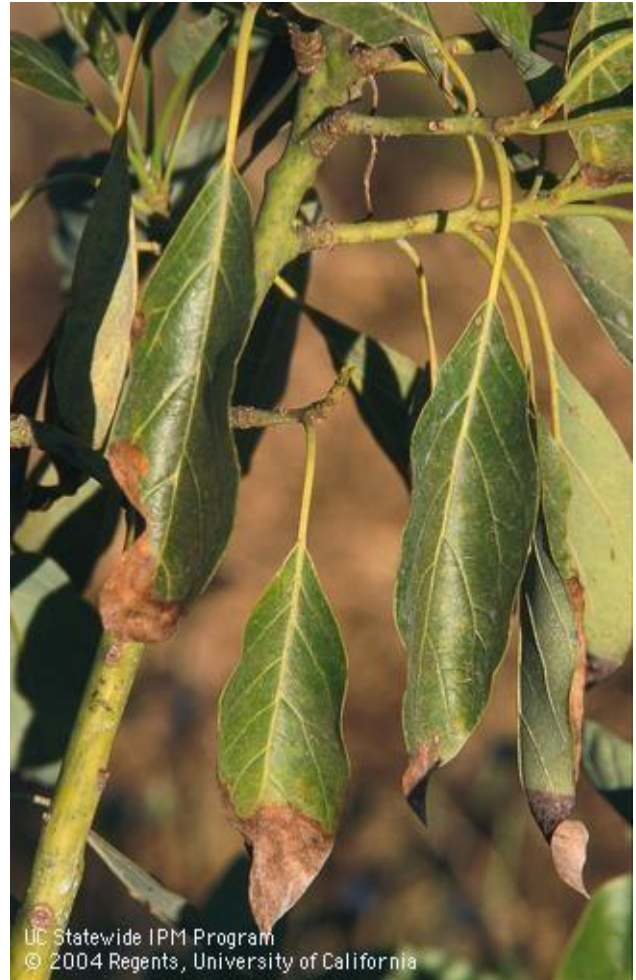
Salt damage due to lack of leaching

Winter irrigation is something we do not commonly perform, but in low rainfall years it is an activity we need to consider, especially for controlling the salts that accumulate from our previous irrigation season.