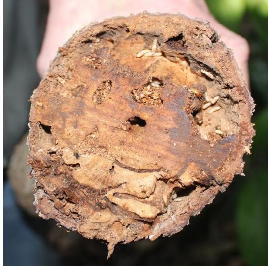
Figure 2. Infested 'Reed' branch in later stages of decline. The white larvae are termites. Once the branch begins to dieback, termite infestation usually follows. Note the staining of the wood and evidence of the PHSB galleries.