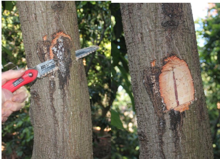
Figure 3. External symptoms of infestation including sugar exudate and bark darkening reveals wood staining due to Fusarium infection of the woody tissue. (Picture taken 3/9/2013 by M. L. Arpaia)