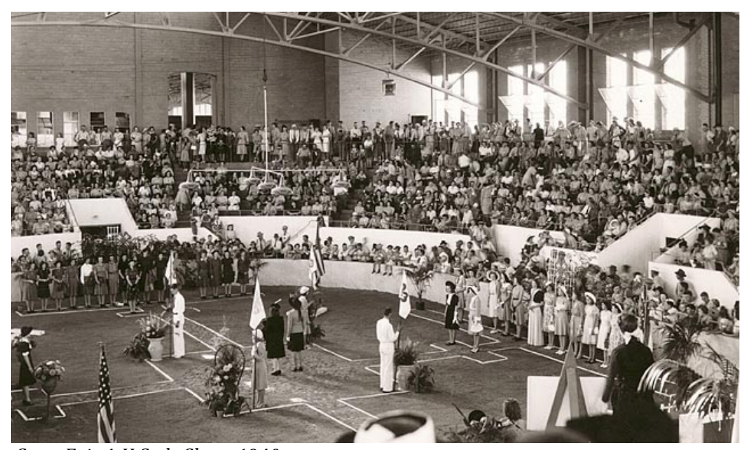
Nebraska State Fair 4-H Style Show, 1940

The early Fashion Competitions & Revues extended to County Fair Competitions, and eventually to State Fair Competitions and Style Shows.