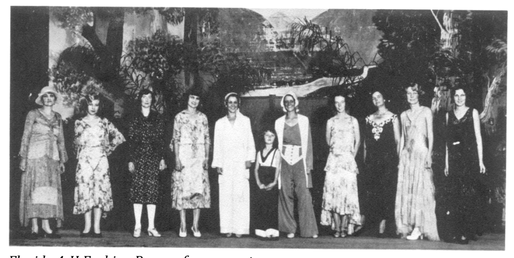
Florida 4-H Fashion Revue of years past

The 4-H Fashion Revue is a well-loved, long-standing tradition, and not only is it interesting, but important, to know a little bit about its history--why we do it, and what skills can be learned from participating in this fun and exciting event.