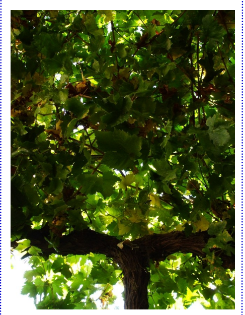
Dense canopies result from excess water and nitrogen fertilizer.

the CDFA main auditorium in Sacramento from 8:00 a.m. to noon, followed by an optional farm and research tour in the afternoon. The June 18 forum will be held at the UC Cooperative Extension office in Tulare from 1:00 p.m. to 5:00 p.m.