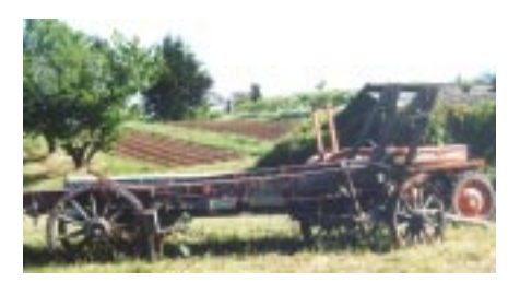
Historically, farm subsidies have been distributed primarily to the country's grain growers.