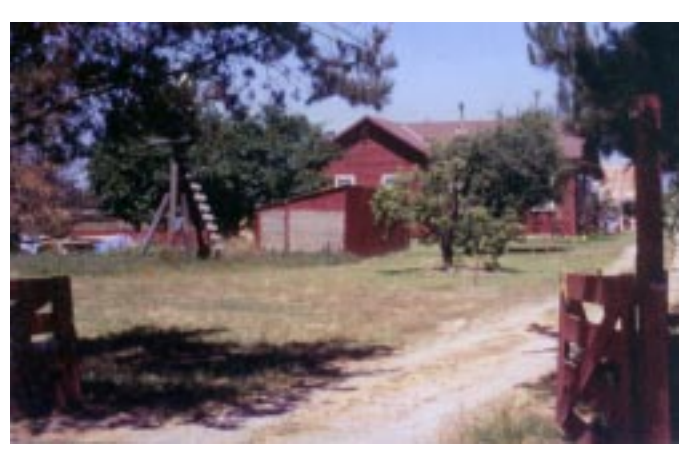
Scenic farm vistas such as this one are valued by three quarters of the Americans who responded to the American Farmland Trust poll.

House bill did some of this, but mainly increased money for the traditional major commodities. A bipartisan amendment