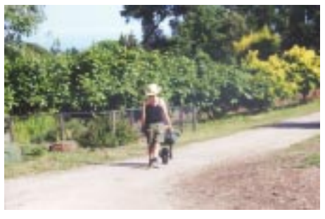
Small family farmers receive few subsidy dollars, but may be eligible for funding to preserve land, air and water quality, and aid wildlife.

Editor's note: The San Francisco Chronicle does not give electronic reprint permission, but does permit linking to its web site for viewing this article at: http://www.sfgate.com/cgi-bin/article.cgi?file=/chronicle/archive/2001/12/06/MN153681.DTL