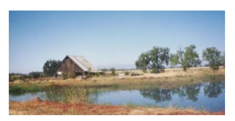
Americans value farmland not only for the food it produces, but also for the habitat it provides for wildlife such as pheasants, ducks and other animals.

Reprinted with permission: Woodland Daily Democrat, October 22, 2001.