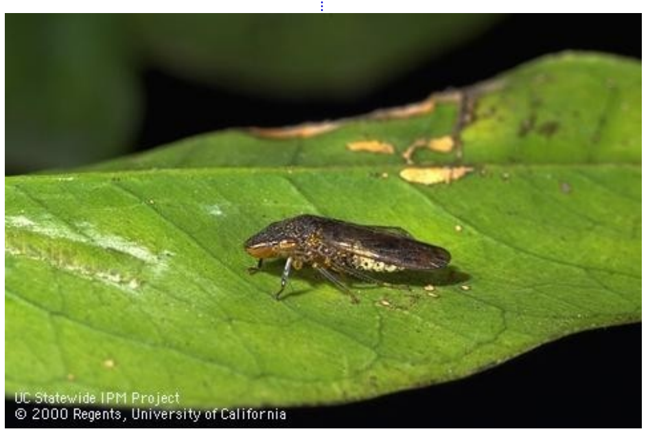
Figure 1. Adult GWSS is approximately 0.5 inches long.