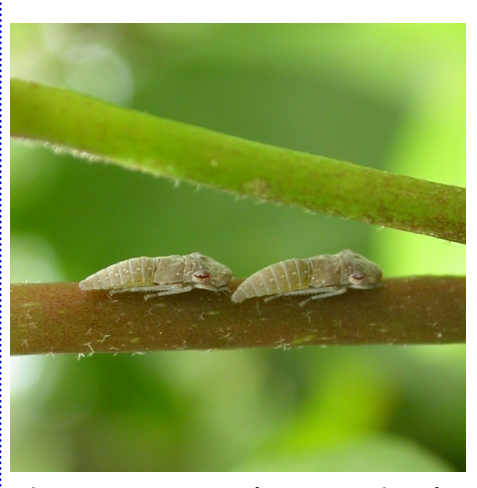
Figure 2. GWSS nymphs are gray in color and have no wings.