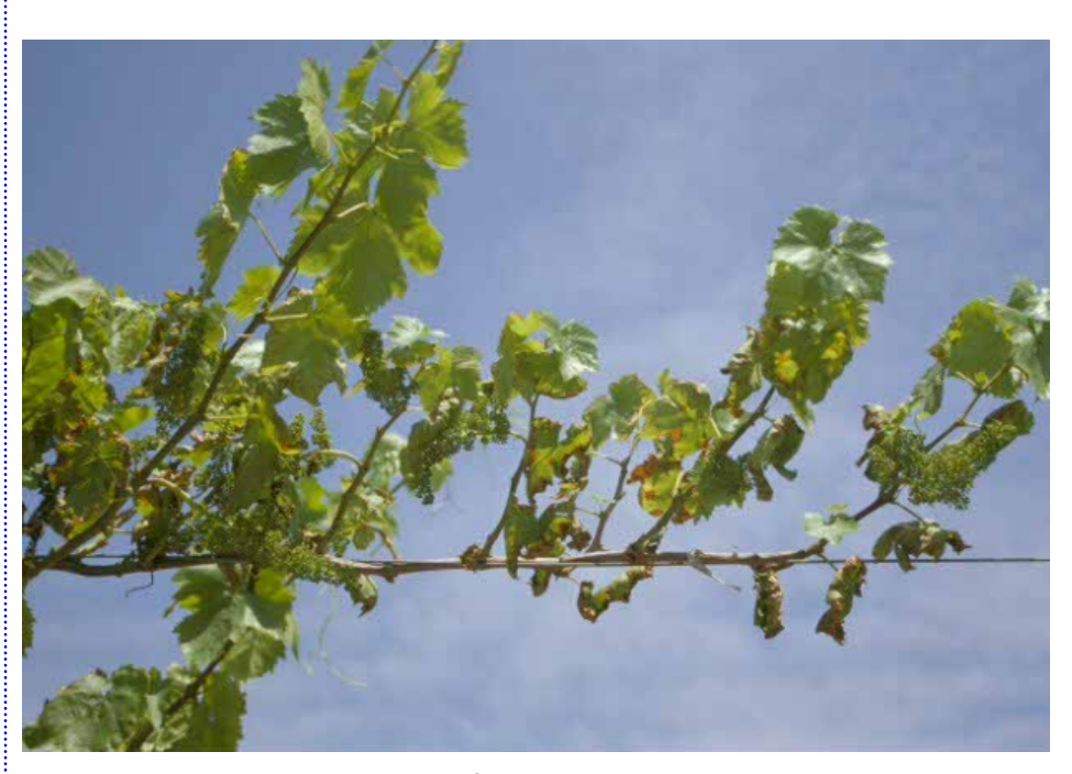
Figure 1. Thompson Seedless spring fever symptoms.

Informational handouts on the heat stress prevention regulations are available online at: <a href="http://www.dir.ca.gov/dosh/">http://www.dir.ca.gov/dosh/</a> HeatIllnessInfo.html.