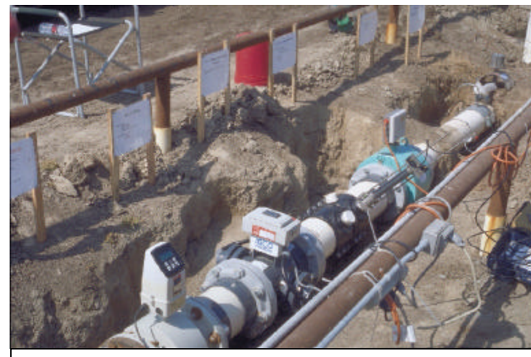
Danfoss, ISCO, Marsh McBirney, and Water Specialties meters at flow meter test in Tulare Countv

meters. These meters require some set up time, with a calibration, which so far has been done by Cooperative Extension personnel. The meters need a small hole in the pipe (2 inch diameter), and they can be removed easily and moved to another location. The other six participants are using either Water Specialties* or Danfoss/Emco* mag meters. which are attached to the pipeline via flanges.