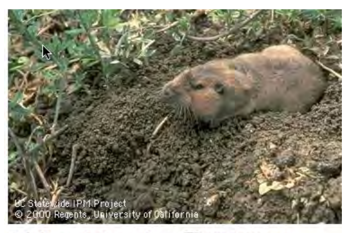
Adult pocket gopher, Thomomys sp.