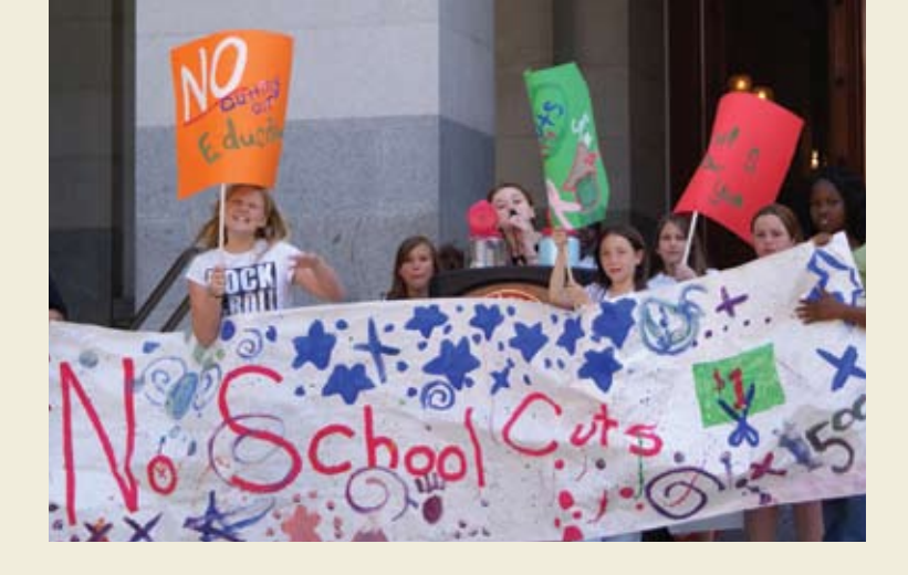
With a goal to influence policymakers, youth from the Rancho Cordova Children, Youth and Family Collaborative went to the State Capitol to let their voices be heard about potential cuts to school budgets. Members of the coalition's Youth Advisory Council met with their elected officials to discuss why the issue was important to youth.

This might be explained by the high turnover of youth coalition coordinators early in the REACH program, since they were the primary source of continuity between the planning phase and implementation phase of REACH. But it also seemed to reflect a more general tendency for adults to challenge or evade youth depictions of their communities. In a few cases, we witnessed meetings during which adults explicitly challenged the youth depiction of disturbing levels of youth violence. It was hard to tell if this was an actual dispute about the facts or simply a reluctance on the part of some adults—particularly public officials to have disturbing facts about the community aired publicly.