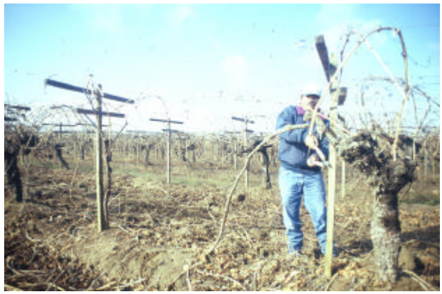
Sever layers after 2 or 3 years preventing the loss of a series of vines if one becomes infected.