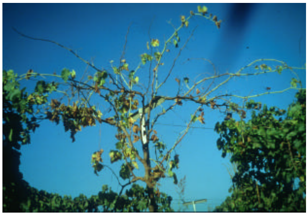
Avoid planting susceptible varieties in PD hot spots (Fiesta dying from PD, 1997).