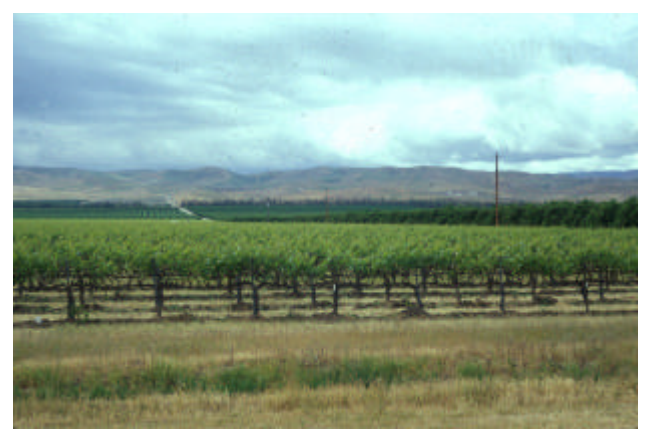
Keep GWSS populations under control which may require a regional approach: General Beale Road Pilot Project, Kern County.