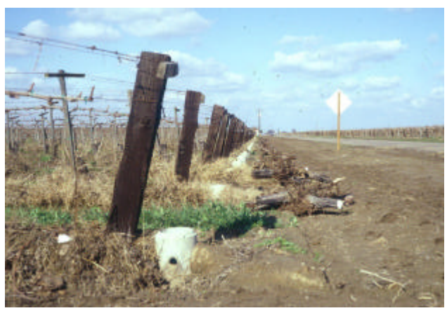
Rogue and replace diseased vines annually. Remove PD vines immediately when GWSS is present.