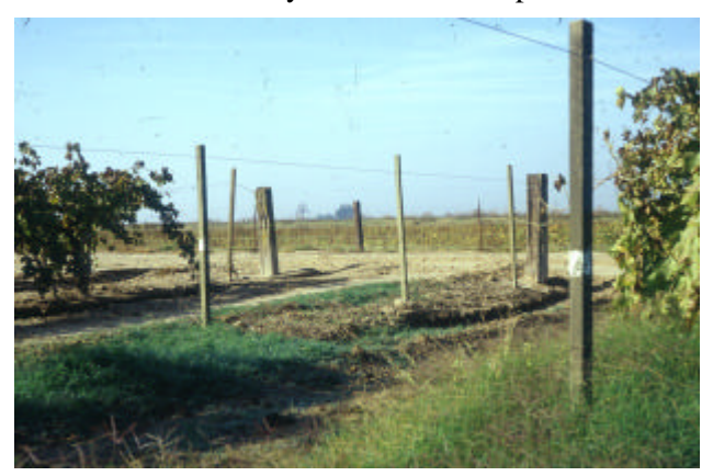
Keep vineyard floor and adjacent areas free of weeds and covercrops that host PD bacterium and vectors.