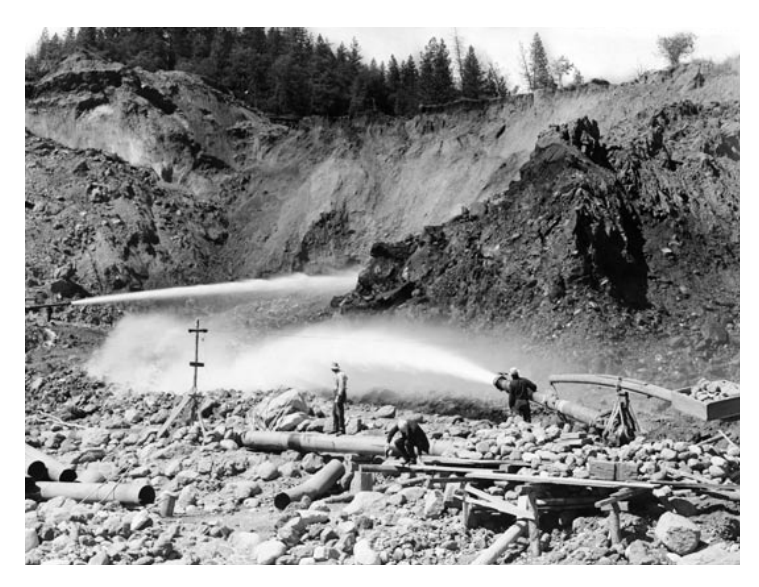
Figure 2. Hydraulic mining, 1860–1870, Trinity County. Streams were diverted through flumes, ditches, and pipes to monitors (nozzles) to wash gold-bearing gravels into sluce boxes for separation of the gold.