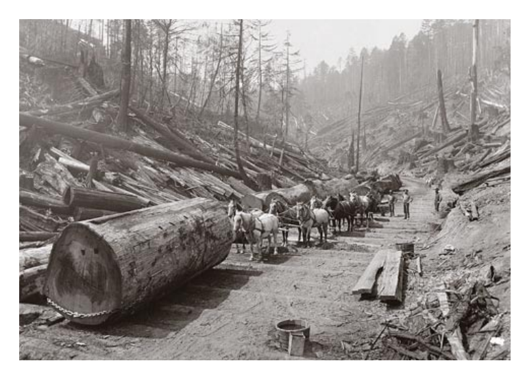
Figure 4. Logging by horse team in the coast redwood forest. Logging roads and trails were often located in a streambed. The effects of this practice are evident in streams to this day.

Railroad construction harvested the forests east of Lake Tahoe for railroad ties, bridges, trestles, and fuel. Construction of snowsheds over the railroad tracks crossing the Sierra Nevada required 300 million board feet of lumber, and another 20 million board feet per year was required for annual maintenance (in comparison, current annual timber growth in the northern Sierra Nevada is about 2 billion board feet). Completion of the transcontinental railroad across the Sierra in the 1860s opened up markets in the eastern part of the country to California lumber. The lumber industry grew between 1890 and the 1920s, when more than 80 railroad logging companies were operating, opening up formerly inaccessible private forestland to development. Railroad logging primarily harvested pine and redwood; fir and cedar were used for fuel. Many of today's forest roads follow the gentle, even grades of these logging railroads.