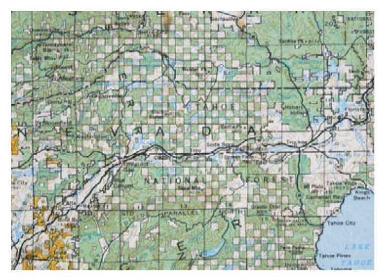
Figure 3. Central Pacific Railroad land grants (white sections) form a checkerboard private ownership pattern with national forest (green sections) along Interstate 80 and the railroad right of way from Sacramento to Reno.