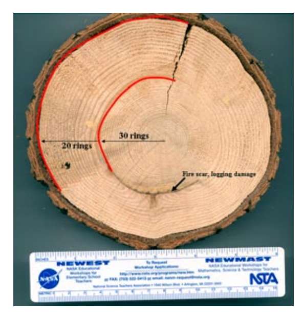
Figure 6. A tree's life history can be observed in its rings. This tree cross-section shows annual rings on a 6-inch diameter white fir (Abies concolor) . Growing in the shade of larger trees, under great competition for light and moisture, the tree grew slowly for 30 years, as can be seen by the inner 30 rings. About 20 years before the tree was cut it was damaged by fire or logging, creating a scar on one side of the stem. That disturbance killed competing trees and subsequently, this tree grew more rapidly in diameter, producing wider rings.