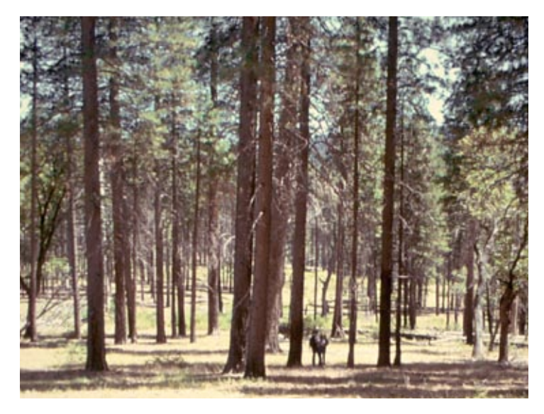
Figure 5. The Beaver Creek Pinery (Ishi Wilderness, Tehama County) has continued to experience frequent, low-intensity ground fires because it is so isolated and difficult for fire fighters to get to. Also, being in a wilderness, managers have been interested in allowing natural processes like wildfire to proceed unhampered unless they pose a threat to life or property. This photo was taken in the 1990s, 5 years after the last wildfire burned through the stand, which is thought to represent the Sierra Nevada forest structure prior to the extensive fire suppression efforts of the twentieth century. For scale, note the people in the center of the photo.

frequently than would be produced by lightning strikes, in some places annually. In the Sierra Nevada this frequent burning produced a forest dominated by fire-resistant pines (fig. 5).