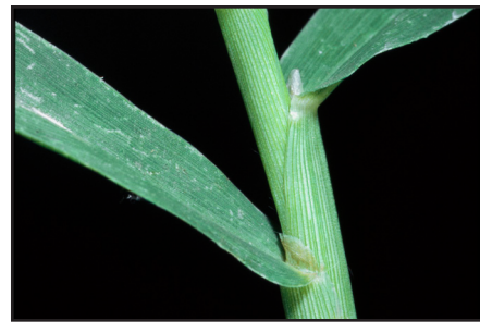
Figure 4. Smooth crabgrass collar region and sheath. The ligule at the base of the leaf blade is a short projection, and there are no auricles.