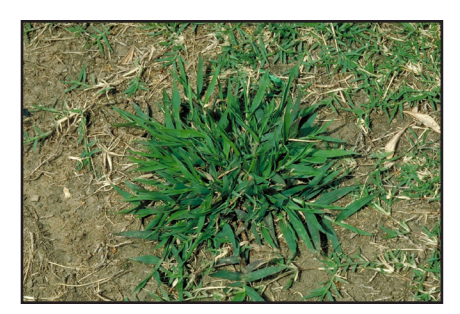
Figure 1. Smooth crabgrass.

Seedling leaves are light green and smooth (Fig. 3). They are very conspicuous in the lawn with their lighter green color. True leaves are dark green but still smooth, and the leaf blade is from <sup>1</sup>/<sub>4</sub> to <sup>1</sup>/<sub>3</sub> inch across, up to 5 inches long, and pointed. Crabgrass often forms patches in lawns, and plants can grow together to form large clumps. The projection at the base of the leaf blade, known as the ligule (Fig. 4), is small