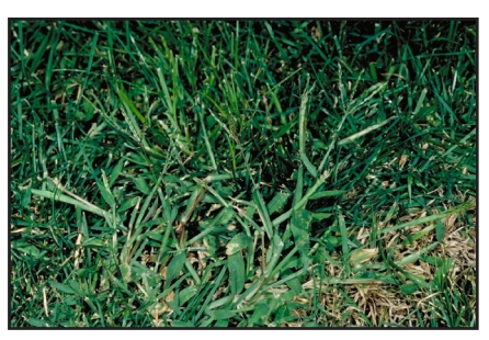
Figure 2. Large crabgrass in a lawn.

Seedling leaves are light green and hairy. True leaves are generally 3 inches long and hairy on the upper surface of the leaf and leaf sheath. The collar region and flower stalk are similar to that of smooth crabgrass, but the branches are longer—about 2 to 5 inches—at the end of the stalk. One source reports seed production from a single, large crabgrass plant can be as high as 150,000.