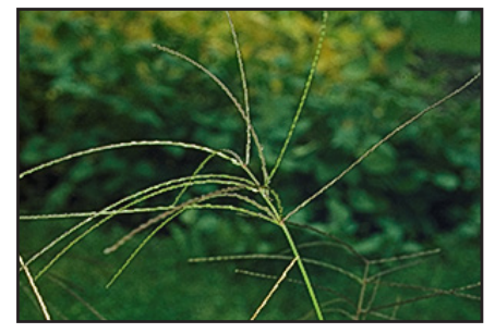
Figure 5. Flowering stem of smooth crabgrass.