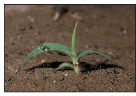
Figure 3. Smooth crabgrass seedling.