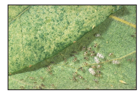
Figure 8. Sycamore lace bugs (shown here) and spider mites can bleach leaves and cause leaf drop.