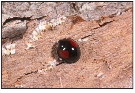
Figure 9. Several lady beetles, including Axion plagiatum shown here, are predators of sycamore scale.

Combination sprays for disease and scale control. Oil sprayed at bud break or early leaf flush helps control