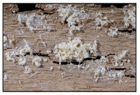
Figure 3. Sycamore scale nymphs and eggs beneath a sycamore bark plate.

Eggs are yellow to whitish and occur in a mass beneath cottony, white wax on bark and leaves. The dry, dark body of the dead female often is next to the egg mass she laid.