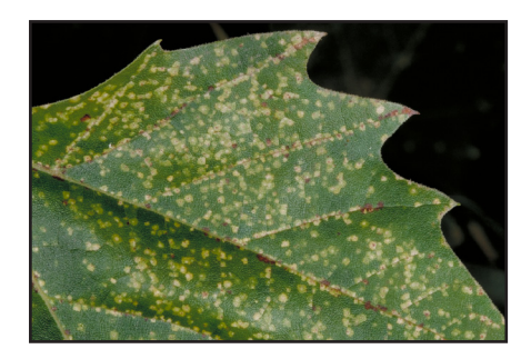
Figure 2. Leaf spotting from sycamore scale infestation.

Eggs are yellow to whitish and occur in a mass beneath cottony, white wax on bark and leaves. The dry, dark body of the dead female often is next to the egg mass she laid.