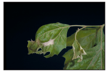
Figure 7. Whitish fungal growth is visible on these sycamore leaves, which powdery mildew has distorted.