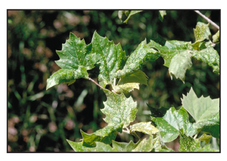
Figure 5. Sycamore scale feeding can distort, curl, and spot leaves.

No treatment thresholds for sycamore scale are available. Trees in landscapes probably can tolerate low to moderate levels of infestation without lasting negative impact. Management is complex, because treatment is most effective at bud break before damage is visible. By the time sycamore scale damage is obvious—during spring when leaves distort, in summer when leaves become severely spotted, and anytime leaves drop prematurely—it's too late to spray effectively. See Monitoring and Chemical Control below.