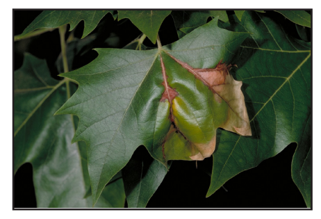
Figure 6. Unlike sycamore scale, anthracnose causes large areas of browning, not leaf spots.