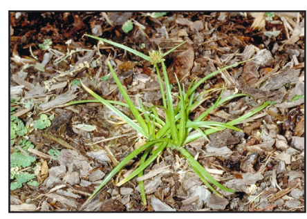
Figure 1. Mature yellow nutsedge plant.

Yellow and purple nutsedges produce tubers, which are incorrectly called "nuts" or "nutlets," thus the origin of their common name. The plants produce these tubers on rhizomes, or