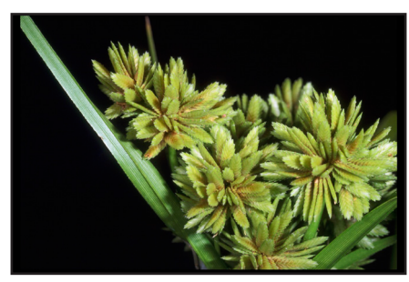
Figure 6. Flowers of tall umbrella sedge (shown here) are dense and headlike in contrast to the looser flowers of nutsedge. Plants also lack tubers and are taller and have wider leaves than the nutsedges.

The best way to remove small plants is to pull them up by hand or to hand hoe. If you hoe, be sure to dig down at least 8 to 14 inches to remove the entire plant. Using a tiller to destroy mature plants only will spread the infestation,