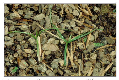
Figure 8. Yellow nutsedge seedling emerging through bark mulch.

because it will move the tubers around in the soil. However, repeated tillings of small areas before the plants have 6 leaves will reduce populations. If you find nutsedge in small patches in your turf, dig out the patch down to at least 8 inches deep, refill, and then seed or sod the patch.