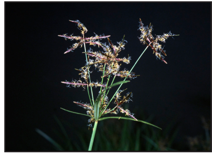
Figure 2. Mature purple nutsedge flower.

underground stems, that grow as deep as 8 to 14 inches below the soil surface. Buds on the tubers sprout and grow to form new plants and eventually form patches that can range up to 10 feet or more in diameter.