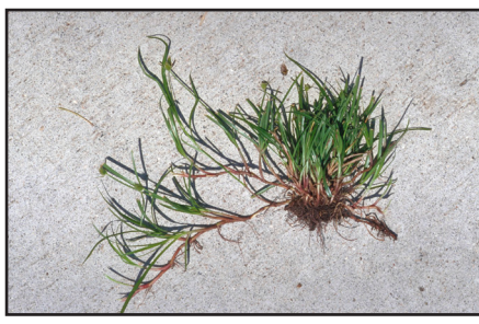
Figure 7. Green kyllinga doesn't have tubers as do nutsedges but instead spreads by rhizomes.