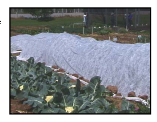
Figure 2. Floating row cover on broccoli and cabbage, protecting crops from cabbageworms.

Floating row covers are popular in commercial vegetable production where crops planted in large blocks are easily covered with row covers. Many brands and fabric types are commercially available.