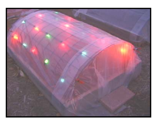
Figure 7. Cold frame with Christmas tree light for additional warmth.

<u>Christmas tree lights</u> – For additional protection, add Christmas tree lights inside the cold frame. In Fort Collins trials, one 25 light string of C-7 (mid-size) Christmas lights per frame unit (four feet wide by five feet long) gave 6° F to over 18° F frost protection. Lights were hung on the frame under the plastic and turned on at dusk and off at dawn. Christmas lights work better than a single, large light bulb in the center by eliminating cold corners and edges. [Figure 7]