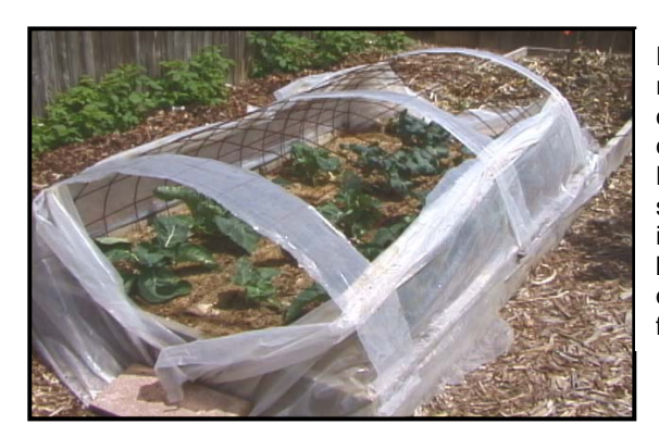
Figure 3. Cold frame for a raised-bed garden made from concrete reinforcing mesh covered with 4-mil plastic. Notice the belt-like plastic straps, which hold the covering in place. The covering is slid between the straps and mesh to open and close. Pictured open for ventilation on a warm day.

An easy cold frame structure for a growing bed is made with 4-mil clear plastic (polyethylene film) draped over concrete reinforcing mesh. The structure is easily opened during warm days and closed for cold nights. It works well with a 4-foot wide, raised-bed garden system. [Figure 3]