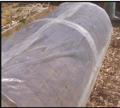
Figure 5. Left: Cover must be opened at least a slit to prevent over-heating. Right: Cold frame pictured closed for a cold night.

On cool days, open the top a crack to prevent excessive heat build-up. On a warm day, the plastic can be slid down the side, ventilating and providing crops exposure to the outdoors. On freezing nights, close the cover completely. On warm nights, the covers may be left open a crack. On stormy days with full cloud cover and no direct sun, the cover may remain closed. [Figure 5]