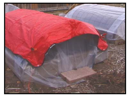
Figure 6. Aluminum space blanket covering a cold frame for extra protection on cold nights.

In trails in Fort Collins, topping a plastic-covered, concrete mesh cold frame with a space blanket prevented freezing when outside temperatures dipped to 0° F following a sunny spring day. The space blanket must be removed each day to recharge the soil's stored heat