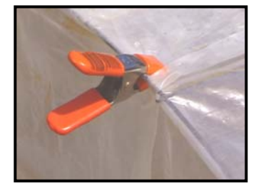
Figure 4. Clip holds plastic on frame.

Hold the plastic onto the frame with small clips available at local hardware stores. Cloths-pins do not hold in the wind. Another method is to use a series of 6-inch wide, belt-like plastic straps arching over the frame (above the plastic cover) and stapled onto the box. Open and close the cover by sliding it between the frame and the belt-like straps. Hold the plastic closed at the ends with a rock or brick. [Figure 4]