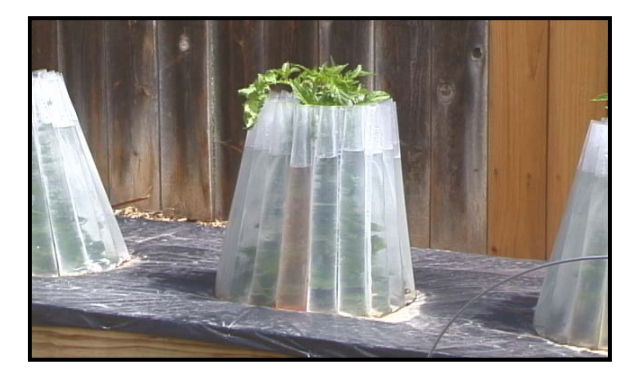
Figure 8. Tomato in Wall-of-Water. Notice use of black plastic mulch to warm the soil, another limiting factor of early production. Also, note the plant has grown beyond the device and is now less protected from frost.

This device works on the chemistry principle of heat release in a phase change; there is a significant amount of heat released as water freezes (changes from the liquid phase to the solid or ice phase). A Wall-of-Water provides frost protection typically down to mid-teen F temperatures. It also provides wind protection for tender plants and growing temperatures may be slightly warmer inside a Wall-of-Water.