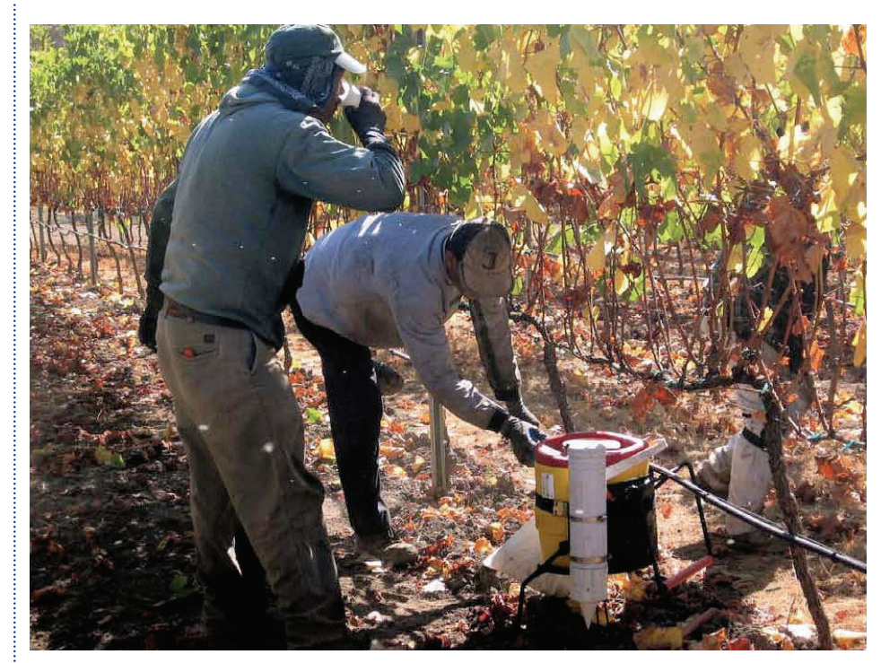
Figure 1. Igloo containers allow for direct access to water and can be easily moved to new locations as the workday progresses.

How do these symptoms develop? When metabolism generates heat faster than needed, adjustments begin in the circulatory system. The heart pumps faster and blood vessels dilate (i.e., expand) to bring more blood to surface layers of skin, from which the heat it carries is conducted, convected, and radiated to the cooler environment. If a body cannot cool fast enough this way alone, or when the air is warmer than the skin, it resorts to sweating, its most efficient means for dissipating heat. Sweat glands draw water from the bloodstream, carrying heat, and send it through pores onto the skin surface, from which the heat transfers more easily to the surrounding air. The evaporation of sweat (turning it from liquid to gaseous state) consumes energy, so it also has a slight cooling effect on the air adjacent to skin surface. The higher the humidity, however, the slower the evaporation and the less it contributes to cooling.