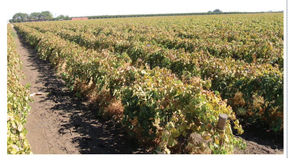
Figure 1. Vineyard in Madera with heavy Pacific spider mite infestation in 2007.