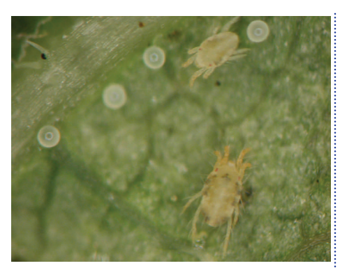
Figure 3. Pacific spider mite female (lower right) with a juvenile and eggs on the underside of a grape leaf.

Resistance management for PSM in vineyards poses an ever changing problem for grape growers. The registration of new miticides provides growers with more treatment options, but the overuse of newer products will eventually lead to resistance development and loss of effectiveness. Effective management of PSM requires a combination of approaches, starting with cultural and biological control, and making use of miticide applications