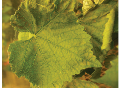
Figure 2. Grape leaf infested with Pacific spider mites. In heavy infestations mites cover leaves with webbing and are found on both lower and upper sides of a leaf.

south Salinas Valley and Lodi showed around 10 times higher resistance to Nexter than the susceptible laboratory population. The Sonoma population showed 4fold resistance to Nexter. Furthermore, we detected 7-fold resistance to Acramite in the Sonoma population and 3-fold resistance in the Lodi population. Lastly, we found 4-fold resistance to Omite in the Lodi population. These results suggest that resistance was likely one of the factors responsible for the reported miticide failures in these vineyards. For Acramite and Omite, the highest level of resistance had developed in the vineyard that had used the greatest number of applications of the respective miticides in the last five years. However, for Nexter we detected the highest level of resistance in the Lodi vineyard that has not experienced any Nexter applications in the last four