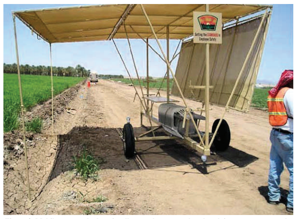
Figure 2. Mobile pop-up shade units allow workers to work or break in an area protected from direct sunlight.