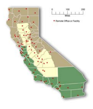
Map of ANR Locations

A paper authored by EH&S Office personnel and entitled Achieving and Maintaining Safe Work Environments at Remote University Locations was accepted for presentation at the 2006 Campus Safety Health Environmental Management Association (CSHEMA) national meeting. The paper describes the EH&S resources that have been developed and are available to assist ANR offices and facilities establish and sustain safe work environments.