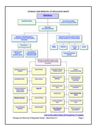
Storage & Removal of Regulated Waste Policy and Procedure

An advisory memo and subsequent updates were prepared to inform ANR staff and supervisors about a new emergency regulatory standard for