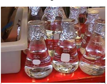
Chemical Containers in a REC Lab

Program reviews were performed at nine RECs and Hansen Agricultural Learning Center during 2005 –