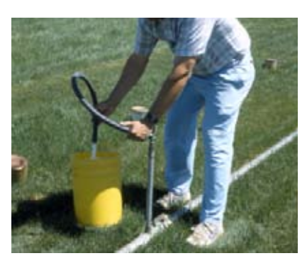
Figure. 5. Determining the sprinkler discharge rate by collecting a measured discharge for a recorded period of time.