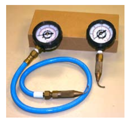
Figure. 3. Pressure gauge fitted with a pitot tube to measure sprinkler nozzle pressure.

Third, the slope of the land also affects the soil intake rate, since water runs off faster from an orchard with a slope than it does from a level orchard.