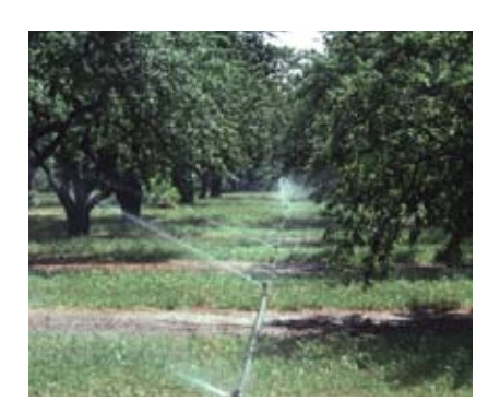
Figure 6. Temporary hand-move orchard sprinklers.

the water into the bucket and timing how long it takes to fill the bucket, the discharge rate from the sprinkler can be determined by the following formula.