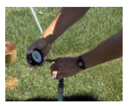
Figure 4. Determining the sprinkler operating pressure using a pitot tube and pressure gauge.