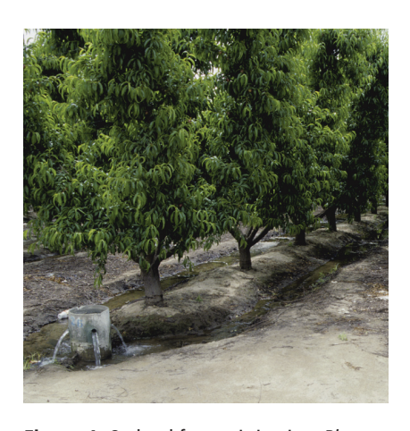
Figure 4. Orchard furrow irrigation.