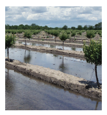
Figure 3. Orchard border irrigation.

To determine irrigation amount to be applied, calculate the total amount of orchard water used since the last irrigation. Using historical crop evapotranspiration information (see "Historical Evapotranspiration," above) or real-time crop evapotranspiration (see "Real-Time Evapotranspiration," above), sum the daily crop evapotranspiration since the last irrigation. This is the amount of soil water that must be replaced by irrigation. It is often necessary to apply additional water due to irrigation inefficiencies.