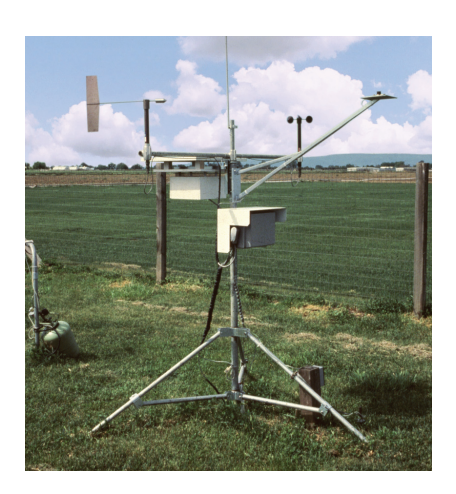
Figure 1. CIMIS station.